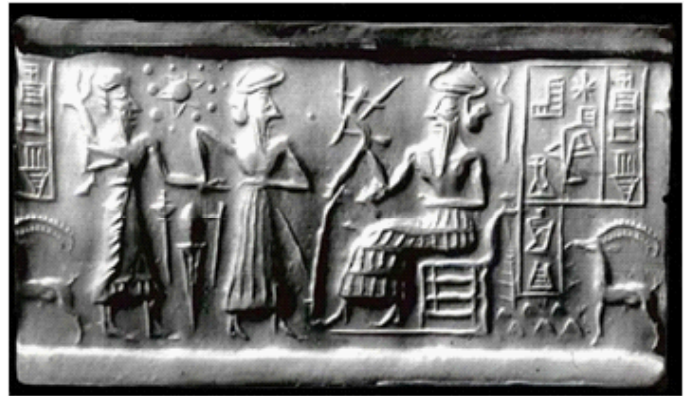
“Nibiru, Annunaki, Planet X”

collision, or near collision, of Nibiru and the planet Tiamat. The Annunaki survived the collision and came to earth and genetically engineered the human species. The mixing of Homo Erectus DNA with that of the Annunaki produced slaves to work the mines for necessary minerals required by those who came from heaven to earth.”