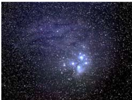
"The Pleiades on Ektachrome 100 film in 1986"

Moreover, it's been revealed that life forms can survive in environments previously thought impossible. NASA wrote on the potential of a widening Goldilocks Zone in 2003 as a function of changing perceptions of survivable environments: